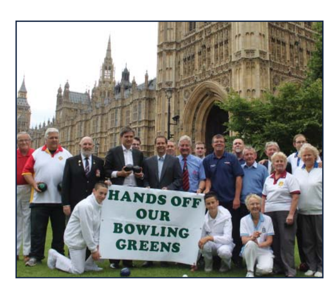
The Lobby of MPs in July is just an example of Bowls England's work to campaign on behalf of clubs at national level

"In July, members of clubs from several counties took the opportunity to make sure their concerns about the threat to clubs from developers and local authority budget cuts were heard during a lobby held in the shadows of Westminster, as